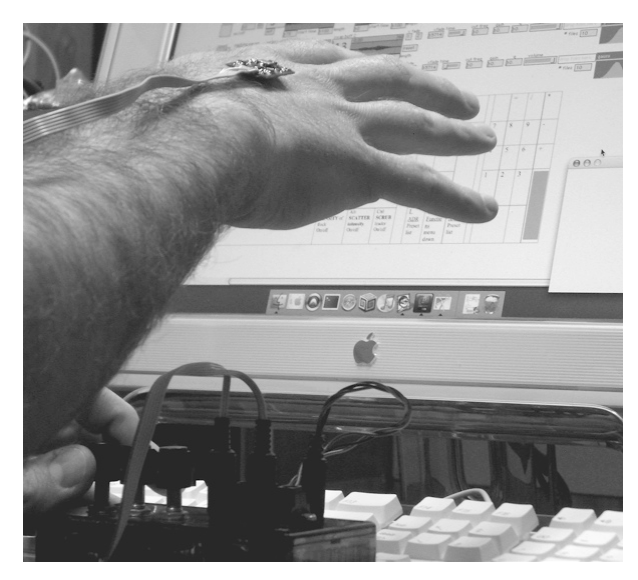
Fig. 1. Photo of prototype Sonic Swarm Controller.

The rotation of the joint of the wrist and vertical movement of the right hand, controlling the spatilisation of the sonic swarm, is mapped using Max/MSP to different parameters affecting the individual agents/sound files. The right hand outputs only 3 streams of data at any given moment coming from the 2-axis accelerometer measuring tilt attached on the wrist of the operator and the infrared sensor measuring distance on the vertical axis. The idea is that the performer is able to interact with the sonic material in a physical way by manipulating a sufficient amount of parameters but without having to control a great deal of sensors. In order though for the device to be expressive and flexible, the performer is able to dynamically assign the 3 streams of data to different parameters at the same time. In this way the same sensor can be responsible for manipulating more than one parameter at once but not necessarily in the same way by using different functions.